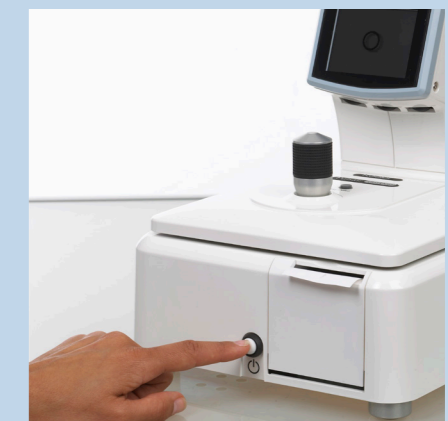
Thermal line printer

3104-L-8201 Chinrest paper 2208-L-7008 Printer paper EP39-70435 Pulsair Desktop dust cover