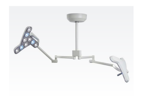
TRIANGO 130 C Duo Ceiling version with dual head system