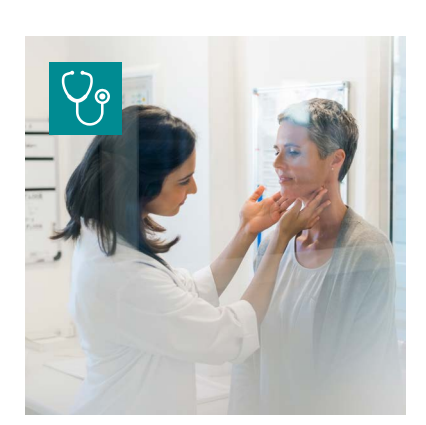
Medical care centers