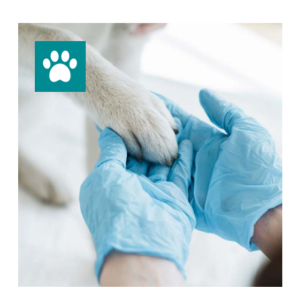
Veterinary clinics / Veterinary practices