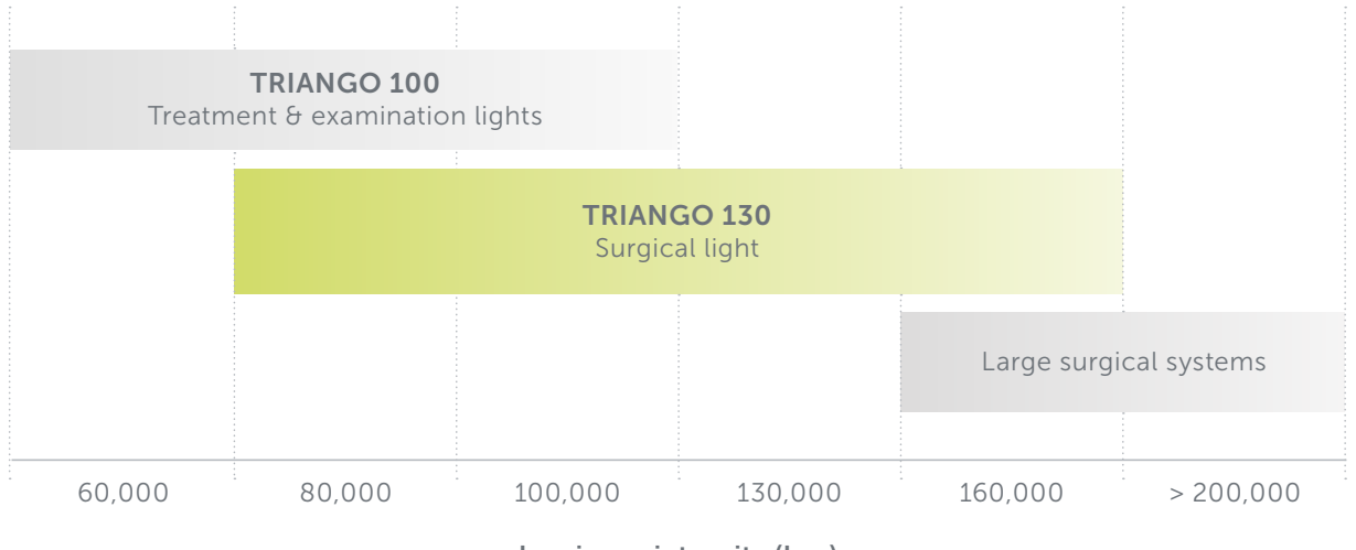
Luminous intensity (Lux)

The TRIANGO 130 sets new standards in terms of brightness in the medical workplace. It is our premium treatment light and offers outstanding lighting properties with an impressive 130,000 lux at 1 meter. The luminaire is also available as a dual head version, which offers even more flexibility and better illumination providing two light fields that reduce shadowing. Thus, the TRIANGO 130 closes a gap between treatment lights and surgery lights.