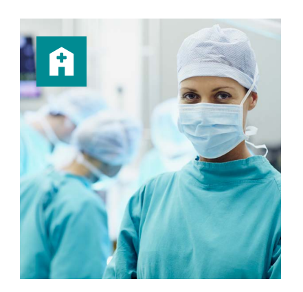
Outpatient surgery centers / clinics / hospitals / emergency rooms