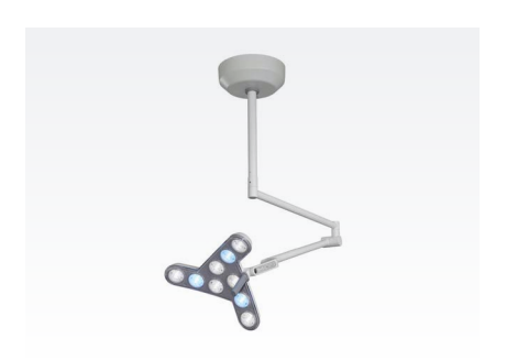
TRIANGO 130 C Ceiling version