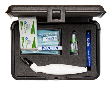
Figure 3.1 - PachPen unpacked