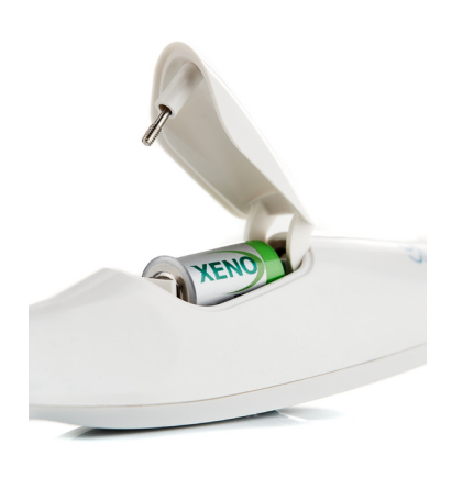
Figure 3.2 - Battery insertion