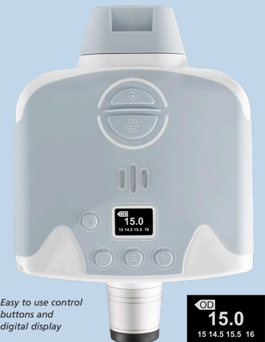
Easy to use control buttons and digital display