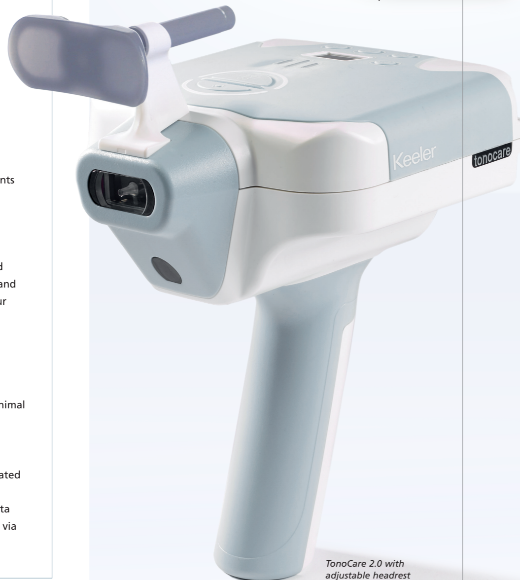
TonoCare 2.0 with adjustable headrest