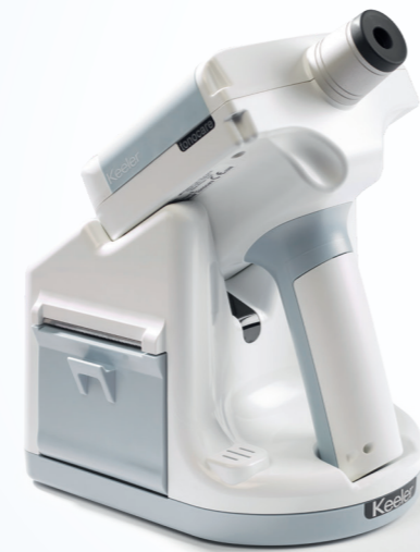
Docking Station with inbuilt printer