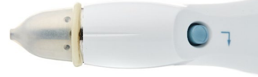
Proper AccuTip Tension

NOTE: THE ACCUPEN MUST BE IN TESTING POSITION WHEN YOU PRESS AND RELEASE THE ACTION BUTTON.