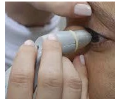
AccuPen Tonometer in Use